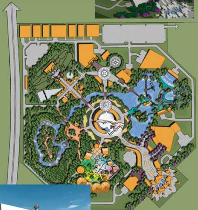
Realms of Imagination Theme Park