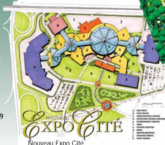
Nouveau Expo Cité